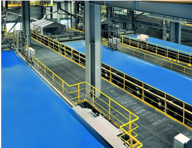
Picture 1: A special production method qualifies the high-performance VACUBELT® filter belts from GKD for phosphorous gypsum dewatering.