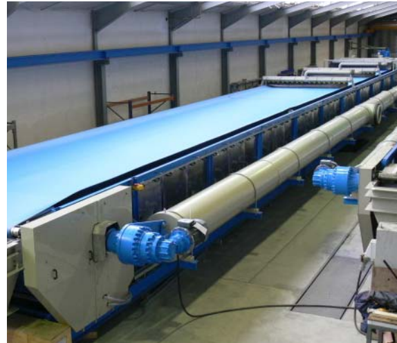
Picture 2: The VACUBELT® filter belt 2015 from GKD has already proven its worth in the field of FGDP gypsum dewatering over many years.