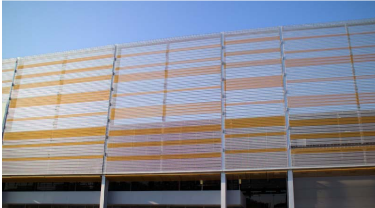
Picture 1: Dominique Perrault gave Pavilion 1 of the Paris Expo Porte de Versailles exhibition center a new face with a 240-meter-long façade made of GKD stainless steel fabric of the type Escale.