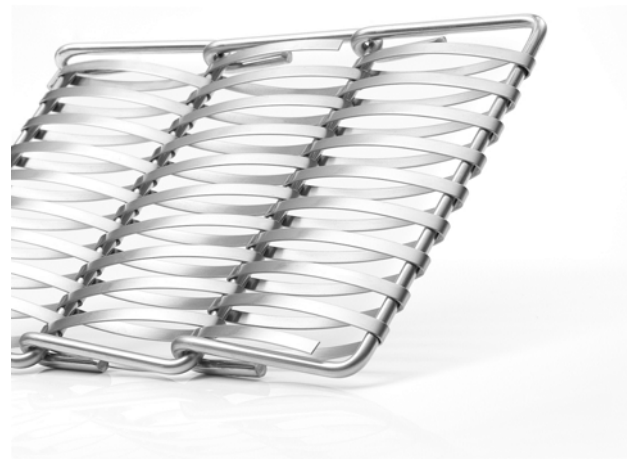
Picture 4: The transparency of the Escale spiral mesh from GKD allows an unencumbered view of outside.