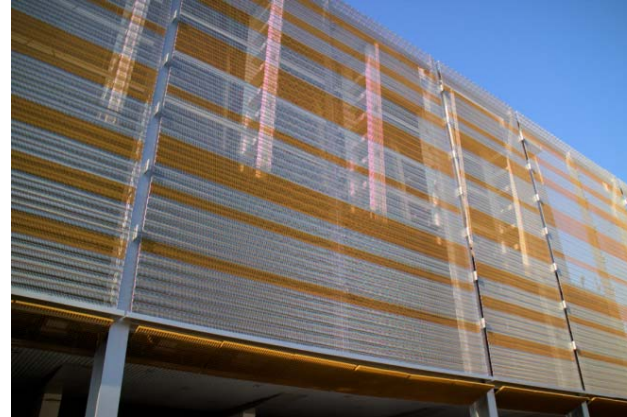
Picture 2: The up to 20.5-meter-high façade made of stainless steel mesh panels of the type Escale from GKD are fastened to a steel construction made from narrow steel struts several meters in front of the actual façade.