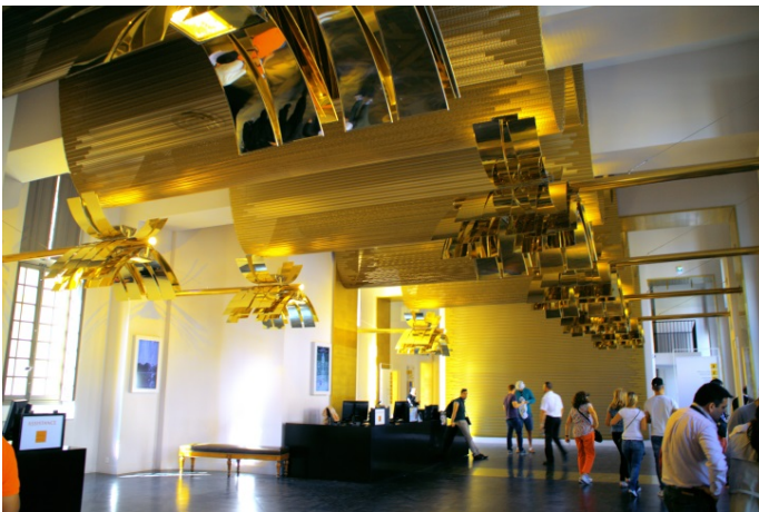
Picture 3: Aluminum rods of varying lengths inserted into flat wires lend the flexible metallic mesh a kind of plastic effect that has never been seen before.