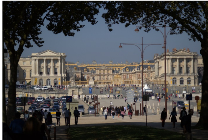
Picture 6: In 2003, the French state announced a €500 million renovation program to give the Palace of Versailles a new lease of life.