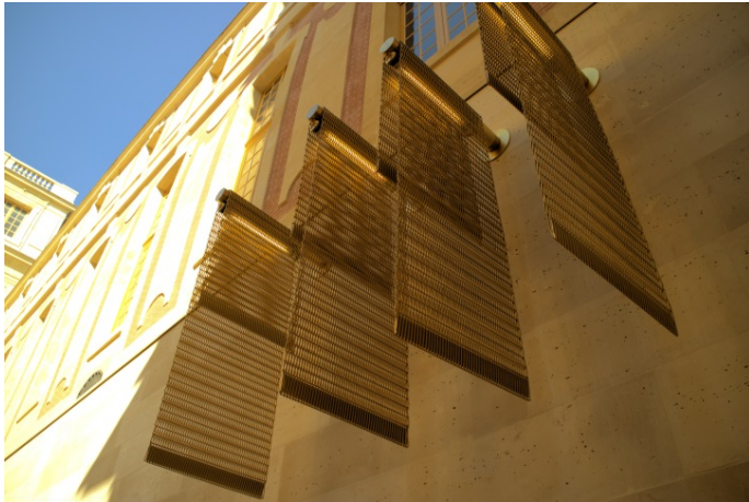
Picture 5: Panels of golden-anodized metallic mesh from GKD, draped like banners above the heads of the visitors.