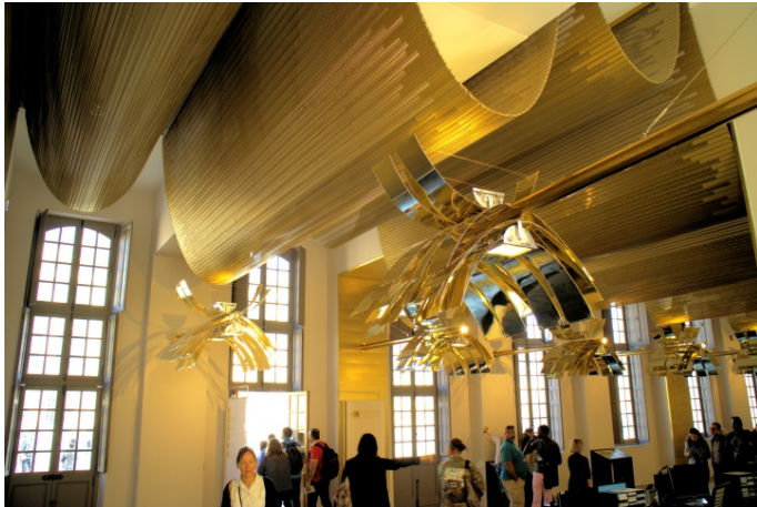
Picture 1: Perrault created a golden ceiling that spans the entire foyer like a giant canopy, creating waves of varying size.