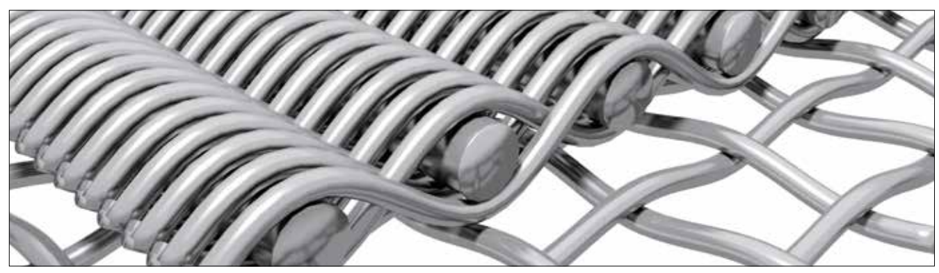
ODW - Optimized Dutch Weave