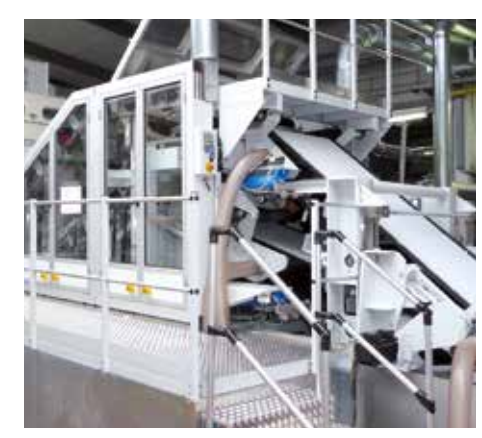
Trützschler Nonwowens - Roller Cards