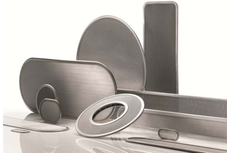
Picture 2: The added value of metal fabric over textile media was a key talking point at the Tehtextil .