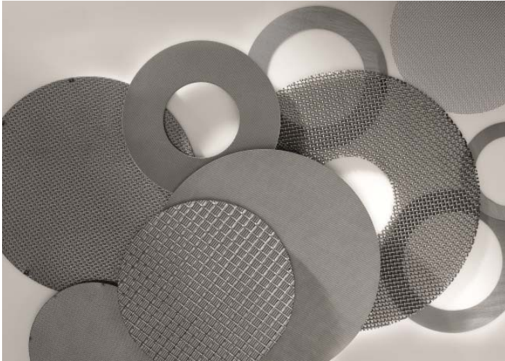
Picture 1: The metallic component lends the fabric a performance spectrum that goes far beyond conventional textile designs.