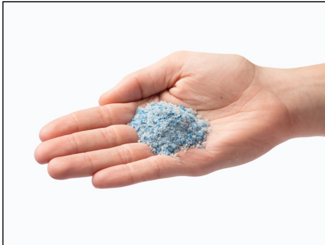
Picture 1: Microplastics, i.e. plastic particles less than five millimeters in size, are a global environmental problem.