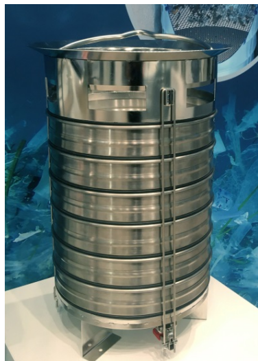
Picture 3-4: GKD developed a sampling basket with up to six filter elements and defined fractionation for sampling an entire rainfall event.