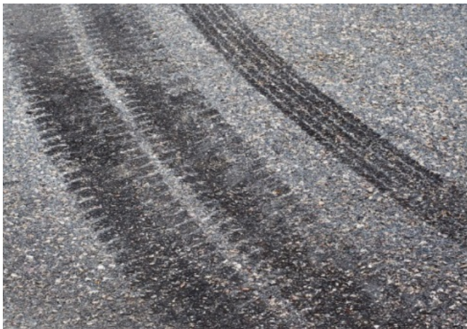
Picture 7: According to the German Federal Environmental Agency up to 111,000 tonnes of tire abrosion materials are produced each year in Germany alone.