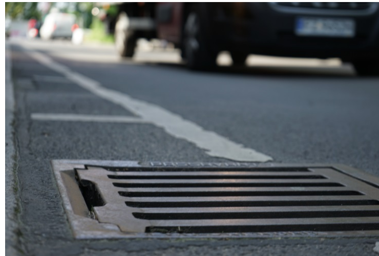
Picture 2: The sampling basket is hung in drains and facilitates reliable sampling of all street runoff water.