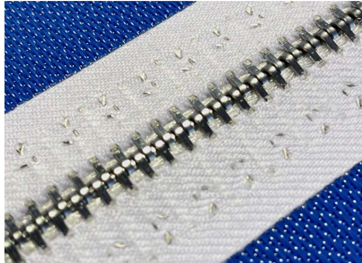
Picture 2: Even on large system widths of up to 4.35 meters and belt lengths of over 70 meters, the VACUBELT® 2015 filter belt with a PAD seam loses none of its stability.