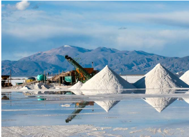
Picture1: For dewatering lithium carbonate the VACUBELT® 2015 filter belt with 50 µm aperture is used.

Process belt solutions for added productivity and yield