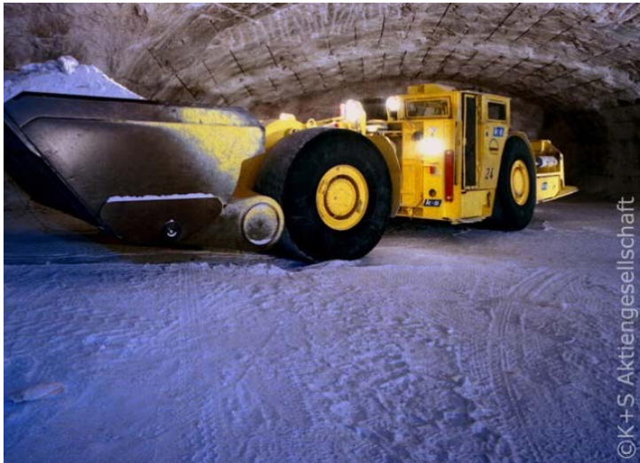
Picture 5: The VACUBELT® 5060 filter belt from GKD has been well established in potash fertilizer production for years thanks to its high temperature and abrasion resistance.

Process belt solutions for added productivity and yield