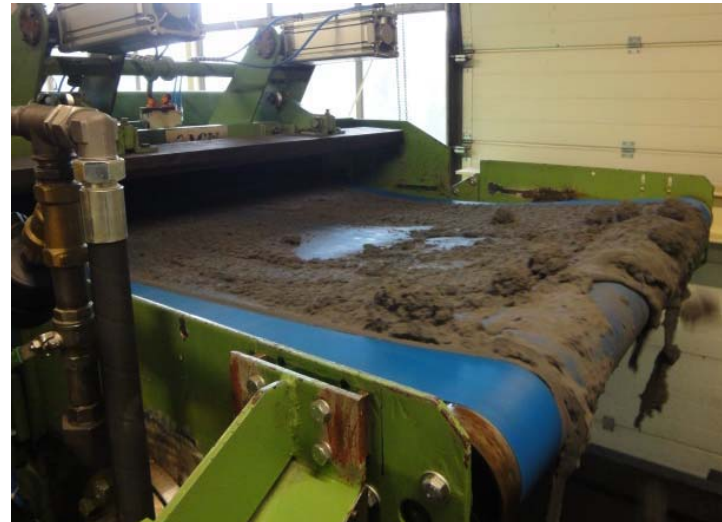
Picture 6: The VACUBELT® 3354 is a proven alternative to common products made of polypropylene in cooling lubricant filtration.