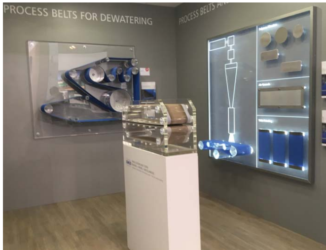
Picture 1: Self-explanatory models at the GKD stand did not only attract visitors from process industry, but also from numerous other sectors.