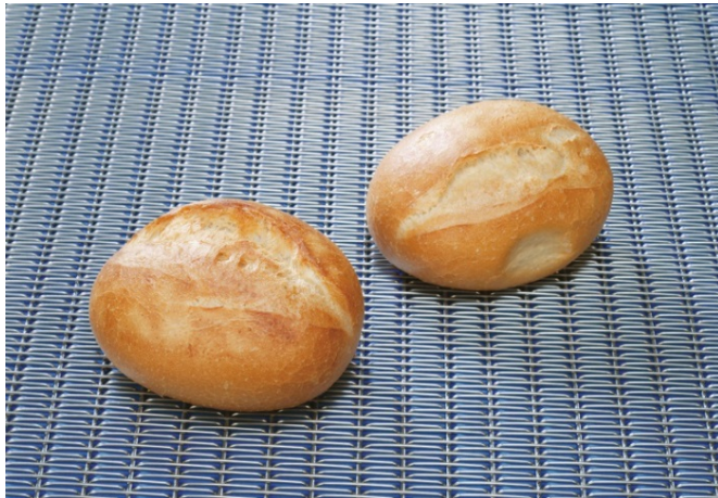
Picture 5: Trackmetic™ belts made of highly tempered stainless steels impress with their hygienic safety when coming into contact with foodstuffs.