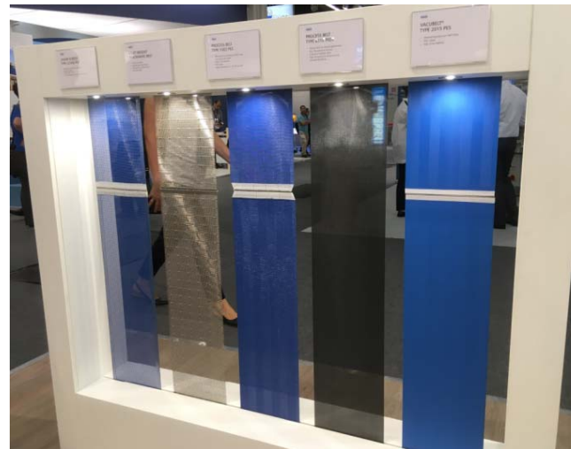
Picture 2: The range of the leading process belts from GKD attracted a great deal of interest among trade fair visitors.