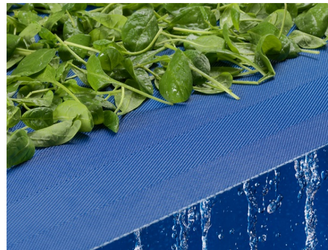
Picture 4: In the food sector, linear screen belts from GKD with FDA-approval are in demand worldwide for applications such as salad washing.

We will be happy to send you the desired images in printable resolution by e-mail.