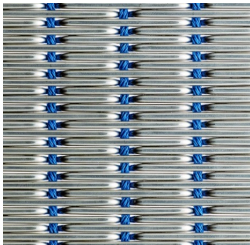
Picture 3: Highly flexible, self-tracking V-crimp type belts made of metal with special plastic cables woven in parallel to the running direction for the nonwoven hygiene product manufacture.