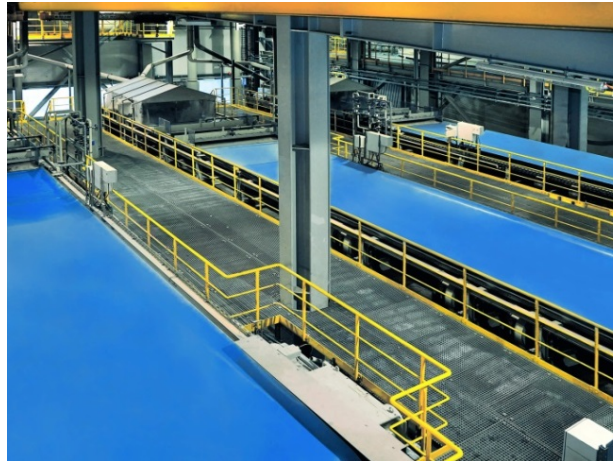
Picture 6: Filter belts from the VACUBELT® product range from GKD surpass the performance of conventional filter belts.