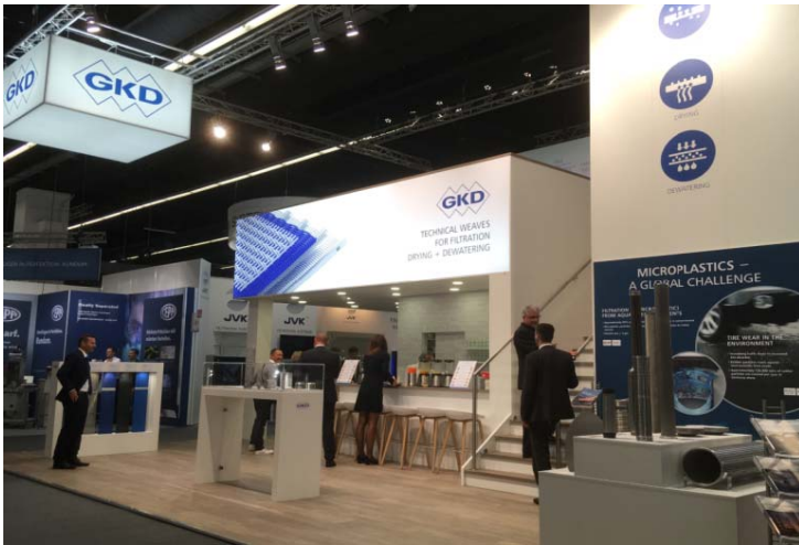
Picture 9: The clearly structured stand caused numerous fair trade visitors to address the GKD experts about topics from other industries.

Scope of solution portfolio strikes a chord with visitors