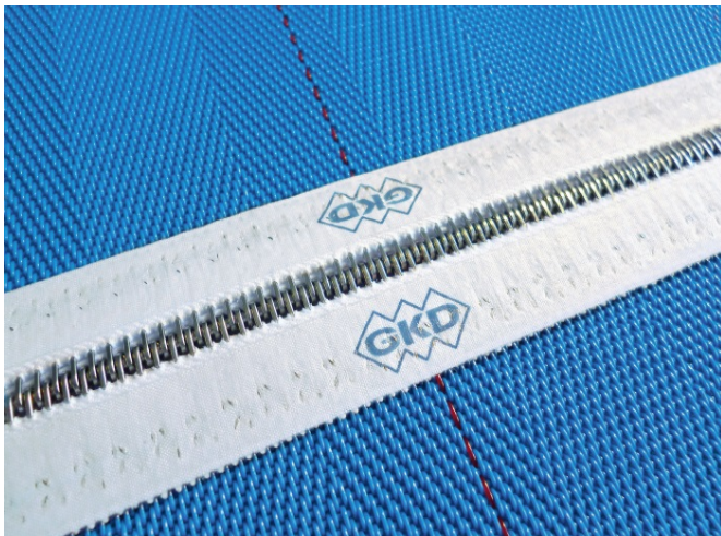
Picture 7: GKD produces all polyester belts for the food industry with thermally sealed edges and food-grade PAD seam.