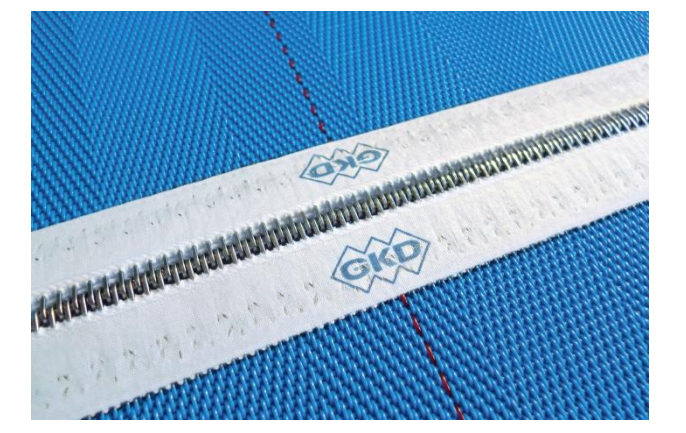
Picture 1: In belt presses, belt type 1003 from GKD impresses with its exceptional transverse stability and its particularly flat, robust PAD seam.