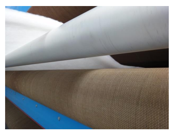
Picture 4: The shrink-resistant belts from GKD guarantee both cost-saving and environmentally friendly sewage sludge drying.