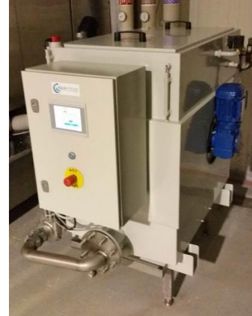
Picture 3: Self-cleaning Rotary Drum Filter of Aquastream with optimised plain dutch weaves (ODW) by GKD.