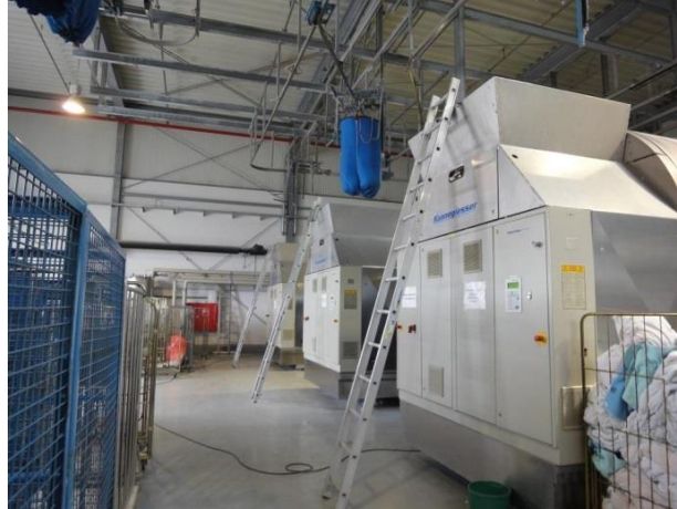
Picture 2: Aquastream Filter in the batch washer removes the washing water from foreign substances like lint and hair.