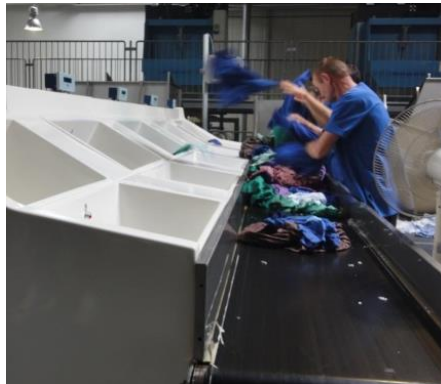
Picture 8: The dry linen is sorted by hand ready for the subsequent processing stages.