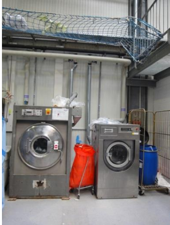
Picture 1: The Aquastream Filter extractors filter 20m 3 /h at the washer for special laundry.