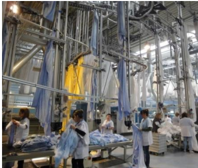
Picture 10-12: The laundry is hung per hand on the clips or hangers of the conveyor system and passes in sequence through a range of ironers where they are also directly folded.

These images are meant exclusively for use in connection with this particular press release on the company GKD – GEBR. KUFFERATH AG. Any other use beyond this expressed purpose, especially use in connection with other companies, is strictly prohibited.