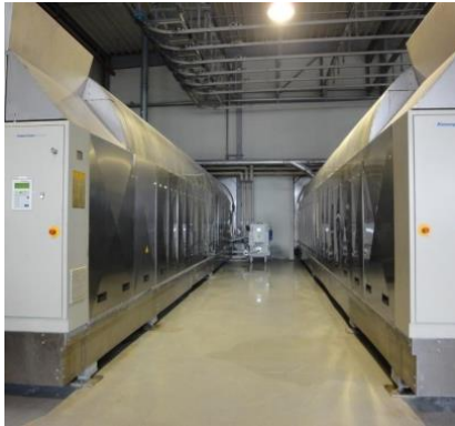
Picture 7: With their absolute mesh size of just 35 µm, the optimised plain dutch weaves by GKD retain even the finest of particles.