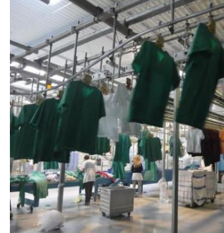
Picture 13: Around 150,000 items are processed per day in the industrial laundry.

impetus.PR Agentur für Corporate Communications GmbH