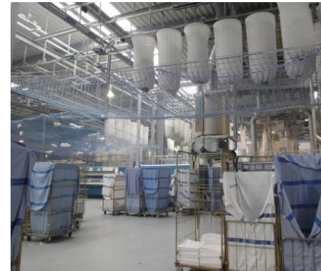
Picture 9: Loaded into a new set of automatically guided transport sacks, the batches are then passed on the respective ironer line.