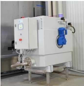
Picture 4: The Aquastream 1.5 Rotary Drum Filter cleans all the washing water and system water.