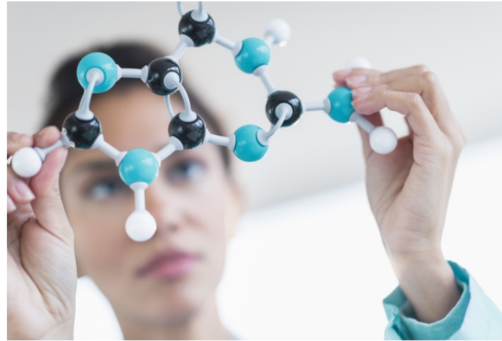
Picture 2: Filter media by GKD – Gebr. Kufferath AG contribute to more efficient processes in the chemicals industry.