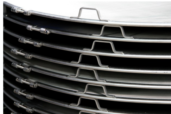
Picture 4: Disc filters made of KPZ-Microdur mesh for cold screening with folded back outer edges optimise the fumaric production at ESIM Chemicals.