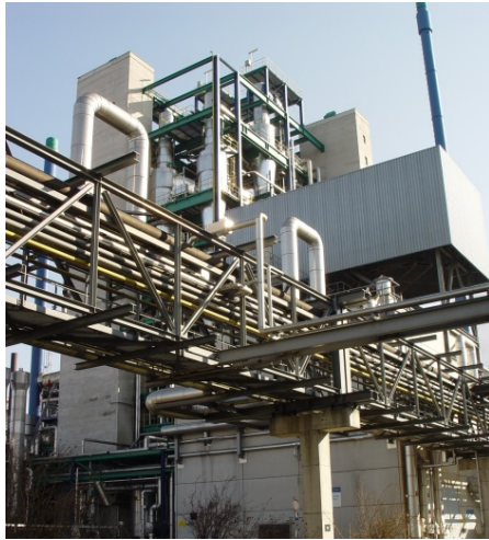
Picture 1: In the Chemical Park at Linz ESIM Chemicals conduct their large-scale fumaric acid production.