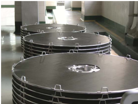
Picture 3: KPZ-Microdur mesh round plates by GKD – Gebr. Kufferath AG.