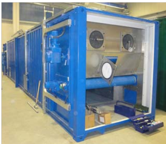
Picture 3: The drying containers are weatherproof, highly versatile, robust and quickly available.