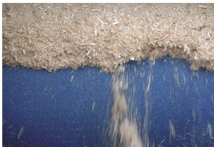
Picture 8: Synthetic mesh belt type Conducto® 5065 for low-temperature dryers.