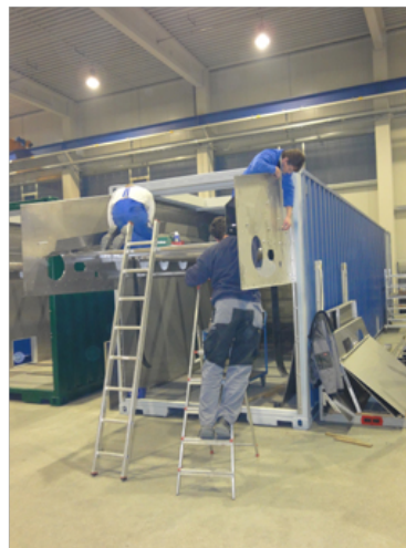
Picture 2: The complete prefabrication takes place at the in-house facility.