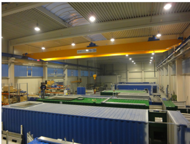
Picture 1: Each week at least one compact belt dryer leaves the factory in Mühldorf am Inn.

Two thirds less residual moisture due to compact belt dryers with woven process belts