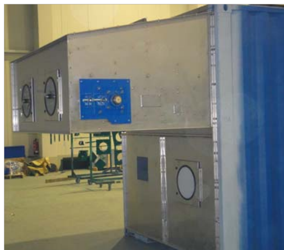
Picture 4: According to the required belt length, the control and exhaust air units are located either inside the container or in an additional container superstructure.