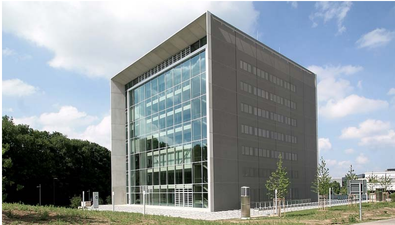
Picture 1: sop architects designed a cube, which, thanks to its fully glazed upper façades, has the appearance of a gigantic gateway to the campus.