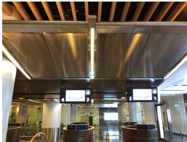
Picture 3: Projecting roofs made from stainless steel fabric from GKD cover the desks, creating a representative welcome area.