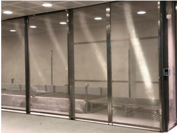
Picture 10: In the oversize baggage claim area, the attractive fabric from GKD demonstrates its functional properties as a ceiling-high room divider with integrated sliding doors in quite an impressive way.