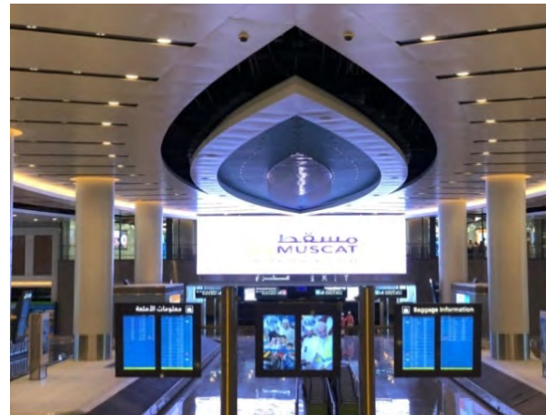
Picture 11-13: A MEDIAMESH® screen produced from Tigris stainless steel fabric from GKD with integrated LED profiles draws all eyes to its gigantic platform for advertising and entertainment.