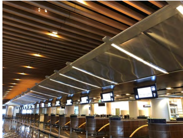
Picture 2: The immigration counters mark an optical highlight in the central wing with their projecting roofs made from stainless steel fabric from GKD.