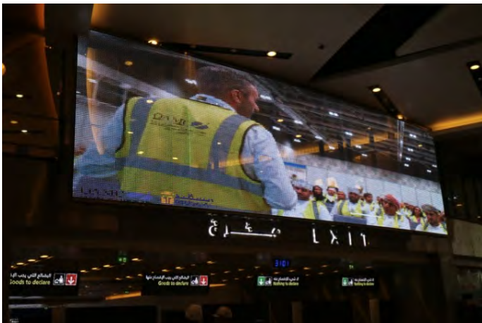
Picture 11-13: A MEDIAMESH® screen produced from Tigris stainless steel fabric from GKD with integrated LED profiles draws all eyes to its gigantic platform for advertising and entertainment.