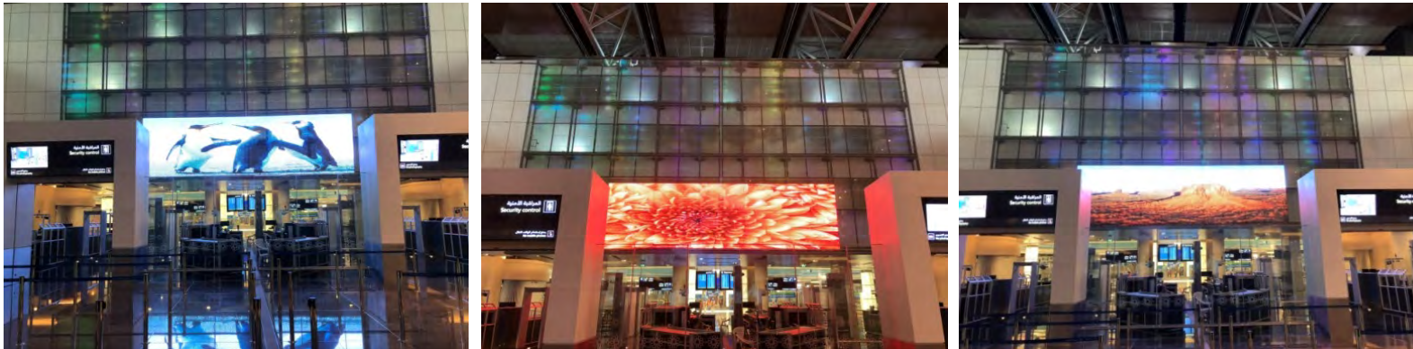
Picture 17-19: In front of the gateway to the retail area an enormous mixed-media screen from GKD, consisting of a MEDIAMESH® Display and a wide frame of ILLUMESH® really draws attention to the advertising and entertainment clips.

We will be happy to send you the desired images in printable resolution by e-mail.