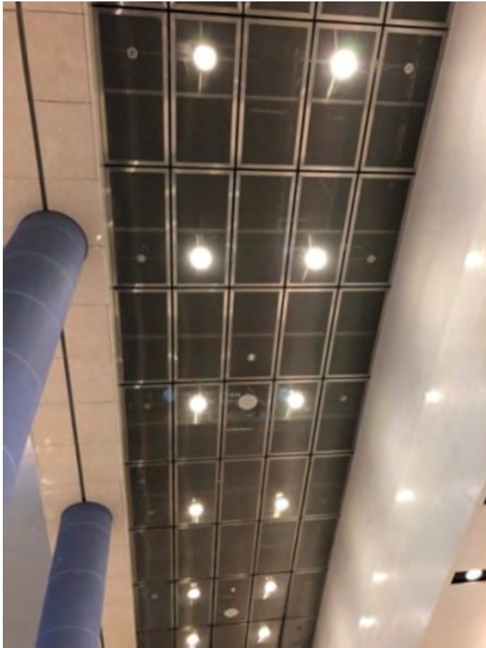
Picture 1: 200 square meters of the grid ceiling made from metal fabric from GKD mark the transitions to both the north and south piers.