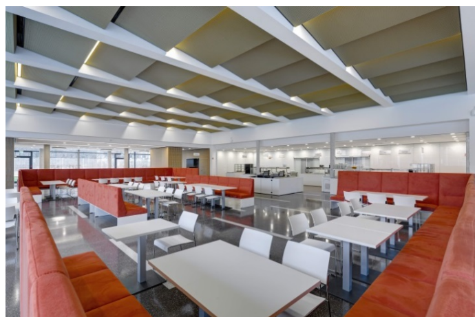
Picture 3: The striking element in the room is the suspended ceiling, made from 400 square meters of golden aluminum mesh from GKD. Its elements with a blade-type design mimic the appearance of sunshine.