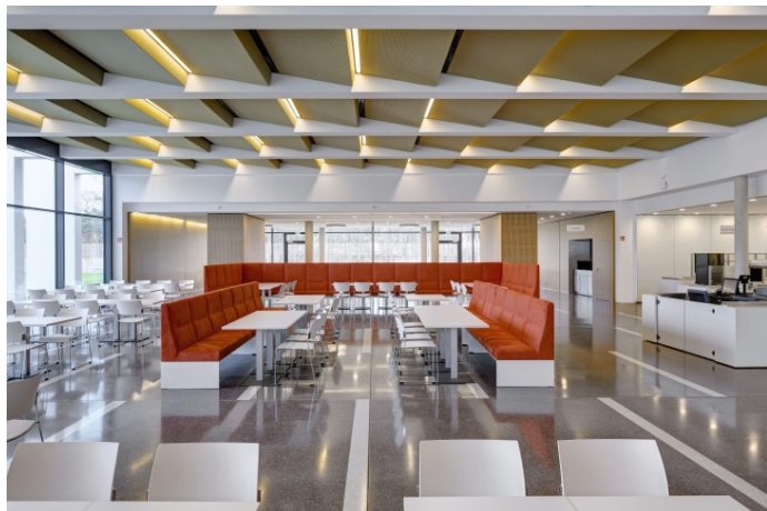
Picture 1: The canteen of the European Organisation for the Exploitation of Meteorological Satellites (EUMETSAT) gets its unmistakable face from a lamella-style suspended ceiling made of golden PC-ALU 6010 aluminum mesh from GKD.

Golden metal mesh used as ceiling in the EUMETSAT canteen