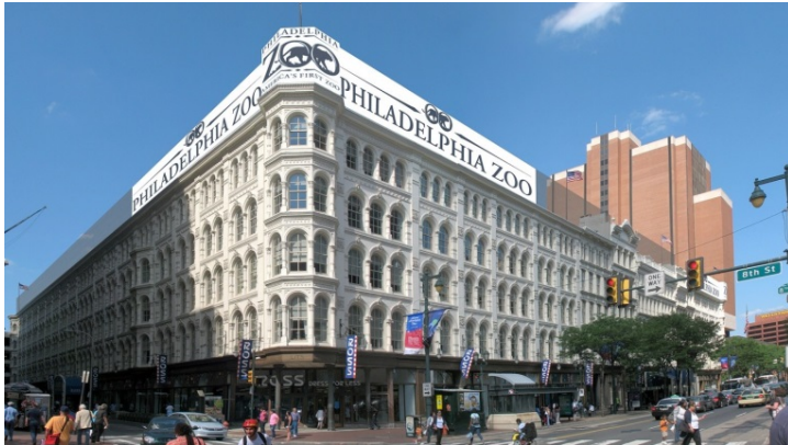
Picture 1: The transparent MEDIAMESH® media facade system by GKD has injected new life into a cult building in Philadelphia.