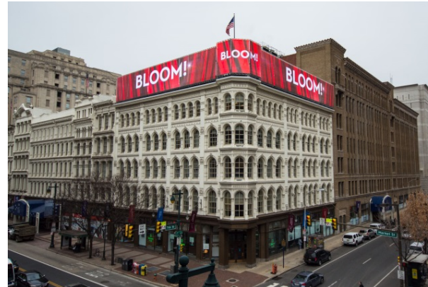
Picture 2: The MEDIAMESH® system by GKD, made of stainless steel mesh with integrated LED profiles, is characterized by its particularly low power consumption and the robust stainless steel material is 100 percent recyclable at the end of its useful life after many decades.