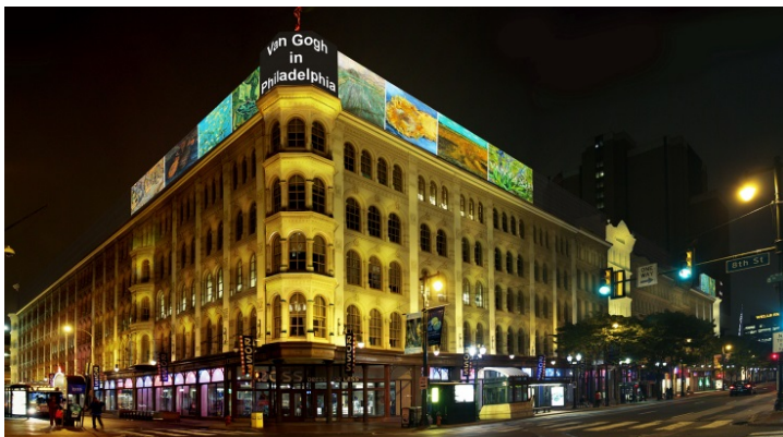
Picture 3: Standing 4.4 meters tall and 110 meters wide, the transparent display in place on the roof of the Mellon Independence Center is the first MEDIAMESH® installation in Philadelphia.