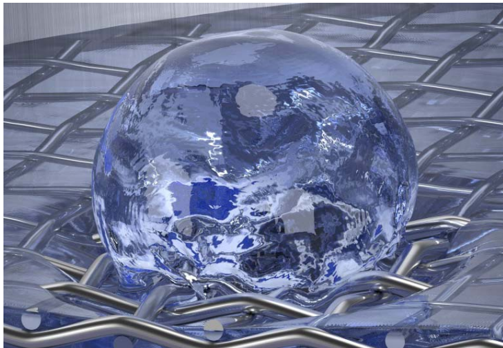
Picture 3: Using a procedure developed in-house, which determines the bubble point with the help of CFD simulations, GKD can determine every pore size quickly and reliably.