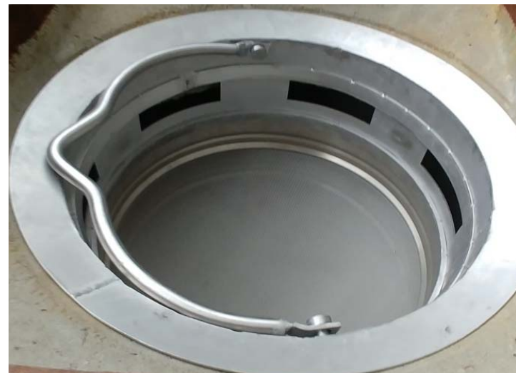
Picture 4: During the RAU project, GKD developed a sampling basket that is used in conventional street drains instead of the usual leaf collecting baskets.

We will be happy to send you the desired images in printable resolution by e-mail.