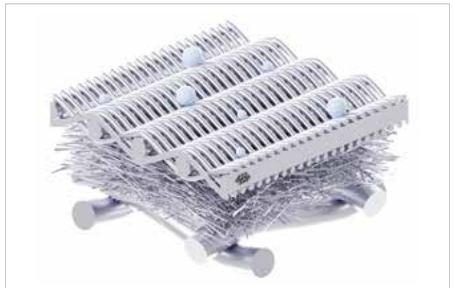
The combination of metal fiber nonwoven on the outflow side and Optimized Dutch Weave on the inflow side is unbeaten in terms of cleaning and filtration efficiency.