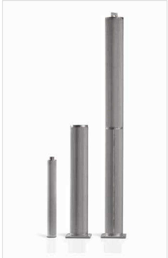
Generally speaking, there is no limit to the filter length with Trimetric filter media laminate

The cleaning properties and filtration efficiency of Trimetric filter media were tested on the basis of series constructions on VDI test benches (VDI = Association of German Engineers). Compared with pure metal fiber nonwoven cartridges or powder cartridges, they exhibit very good regenerability, are also resistant to breakage, and comparable with PTFE media in terms of their retention rate – however only for temperatures up to 600°C. All of which means that Trimetric filter media significantly contribute to increasing process efficiency, reducing CO 2 emissions, and maximizing cost-effectiveness.