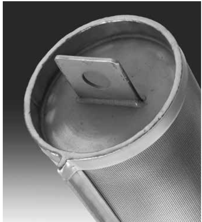
Special seam technology developed by GKD: thanks to tight fixing, the mesh is only subjected to minimal bending/alternating stresses.

Hot gas filtration can be achieved with appropriate support baskets using pure wire mesh layers. The ideal meshes for this are Reversed Plain Dutch Weaves, which boast increased tensile strength thanks to their structure. This makes it possible to attach these meshes to standard supporting bodies that are already in place, including those typically used for textile media.