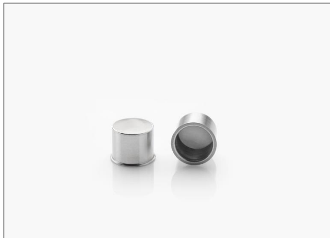
Image 3: Optimized Dutch Weave with a 5 \mu\text{m} -pore size is the core element of the measuring crucible for sampling and analyzing aqueous liquids GKD developed this product in conjunction with the German Federal Institute for Materials Research and Testing (BAM) and the German Federal Environmental Agency (UBA).