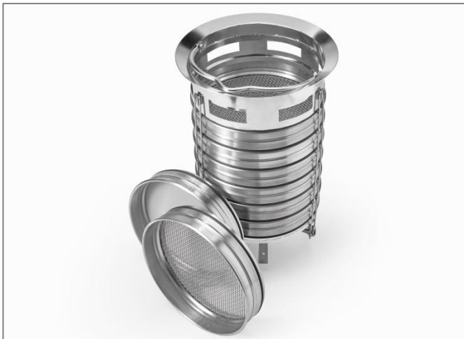
Image 4: This sampling basket with integrated filter cascade, developed by GKD, enables scientific sampling of road runoff or seepage water